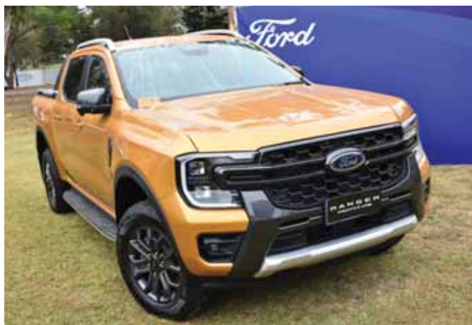
The prototype of the all new Ranger.