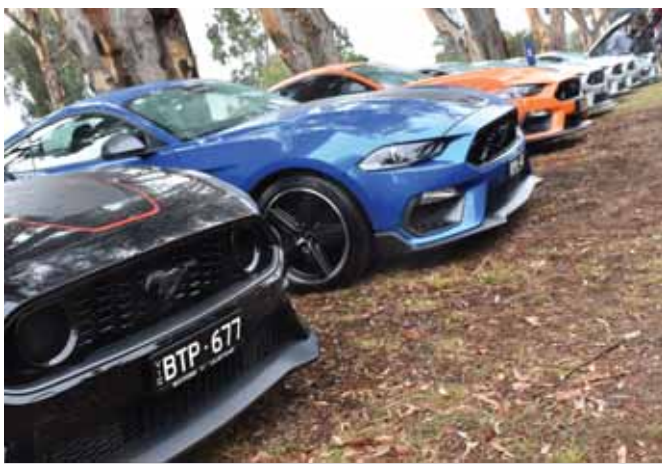
Mustangs into the horizon.

With Ford in the blood, whether it was the exhibitors or the visitors, passion for the brand was unmistakable. Kids were engaged in wiping down dad’s pride a joy as the inconsistent weather kept them busy; Ford experts