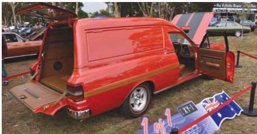
The 1971 V8 XY Panel Van.

So, as another great day came to a close, I am convinced that everyone was a winner, notwithstanding the competitive aspect of the day. The exhibitors, the sponsors, the enthusiasts and, of course, the general public who, like me, grew up during the glory days of the Blue Oval. Everyone involved in making the 31st All Ford Day a success is to be congratulated – what a great event!