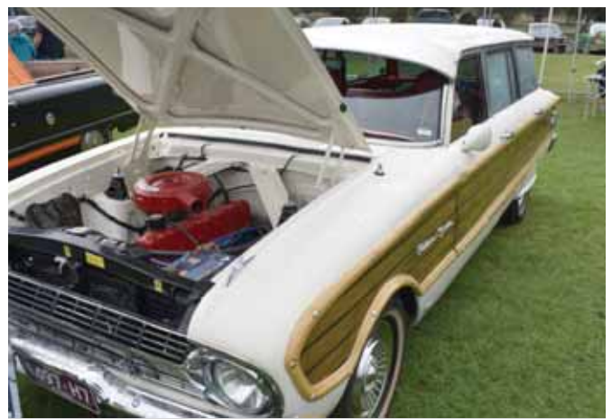
The 1963 Falcon Squire.