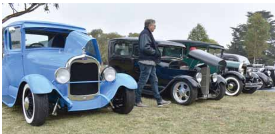
The '20s and '30s were out in force.