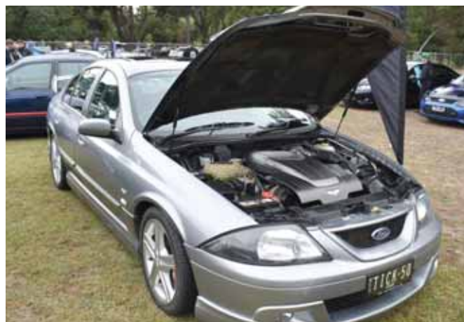
The Tickford T-Series.