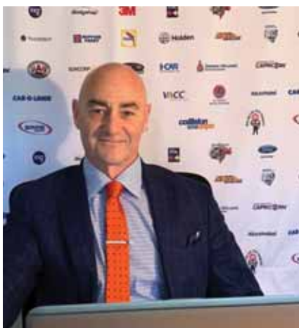
All set to go for our first virtual event.

This event was, of course, to recognise the contributions of the inductees for 2020 and add them to the 43 existing inductees who have shaped, built, disrupted, influenced and developed the collision repair industry since the second half of the 20th century. This year there were 10 worthy nominations from around the country, although three in particular attracted the attention of the voters, our sponsors and existing inductees. The inclusion of this year’s inductees brings the collective experience of all 46 inductees to over 1,500 years!