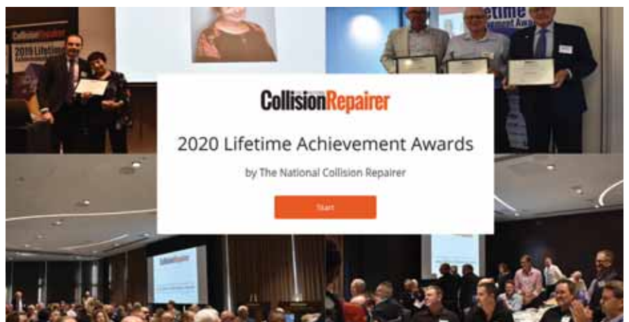
Opening page of virtual broadcast.